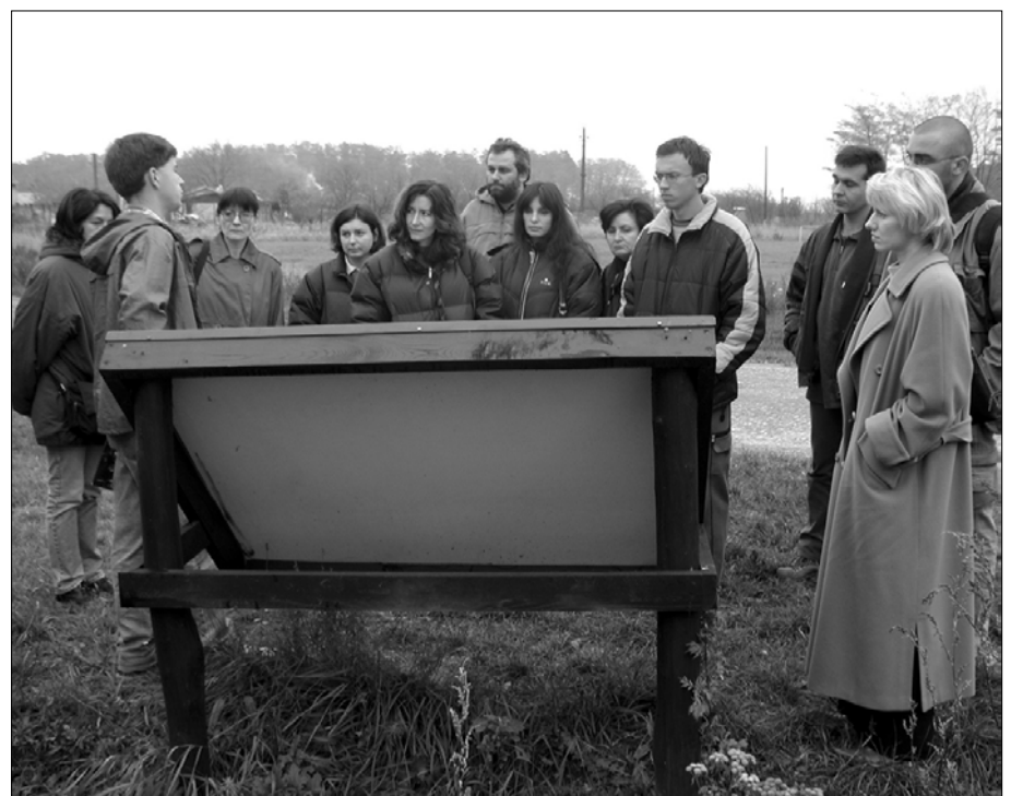
DEF General Assembly 2002 – fieldtrip to Morava River floodplain.

For the complete list of DEFYU members please see the website.