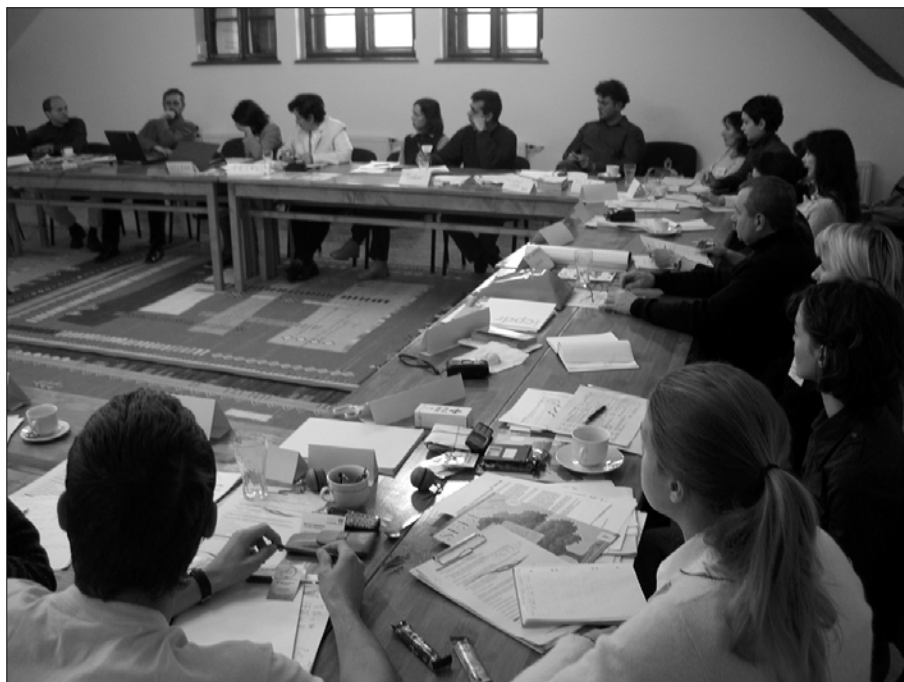
DEF General Assembly 2002 in Vinicne, Slovakia.

DEF National Focal Point in Republic of Moldova is Ecological Movement of Moldova (EMM). EMM is a voluntary and non-governmental environmental organisation committed to restoring the natural balance between the environment and the population of Moldova through