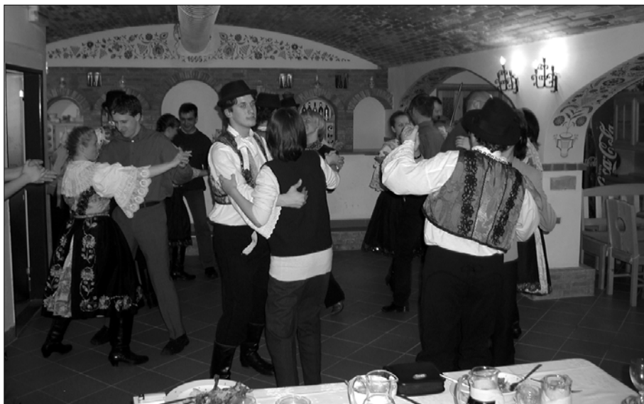
Celebrating successful General Assembly with Slovak festivities.