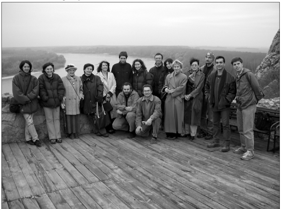
DEF members exploring Danube beauties in Slovakia.