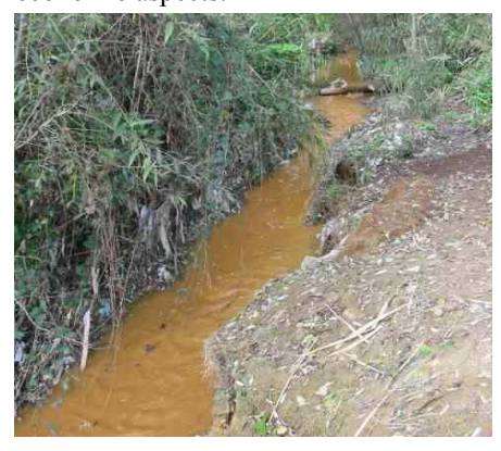
River Kiselica polluted by acid mine waters, Probištip Macedonia

From amongst the priorities recognised by those projects in the category of legal and policy development, the highest priority is given to the activities on elaboration of new sustainable development plans and spatial plans as well as to development of legislation, while in the category of treating technical priorities, the priority is given to activities focusing on the rehabilitation of contaminated areas and the treatment of mine waters. Beside these two categories, the documents also address the activities in the categories' institutional problems, information dissemination, education and scientific and research work, public participation and socioeconomic aspects.