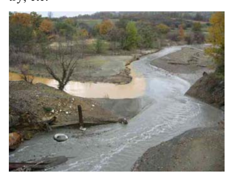
Dead Borska river polluted by acid mine drainage (right) and wastewater from battery factory (left), Bor, Serbia

mental and socio-economic problems resulting in national and regional disparities. Many of the communities believe that the way out is reorientation from mining towards other types of activities, mainly the development of tourism, agriculture, small scale industry, etc.